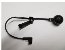
SPARE BOOM MICROPHONE FOR HEADSET