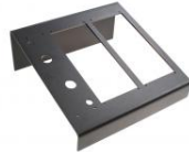
TRIPLE DESK STAND