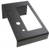
DUAL DESK STAND