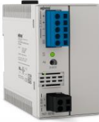
POWER SUPPLY 100-240V AC/24VDC 4A