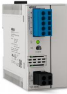
POWER SUPPLY 100-240V AC/24VDC 2A