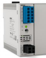
POWER SUPPLY 100-240V AC/48VDC 2A