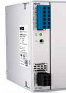
POWER SUPPLY 100-240V AC/48VDC 5A