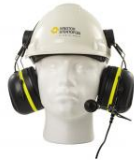
AK5850BS EX TWINCOM HELMET HEADSET W/EAR PLUG CONNECTOR