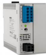
POWER SUPPLY 100-240V AC/48VDC 2A