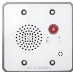
1008116010 TMIS-1 Turbine Mini Intercom