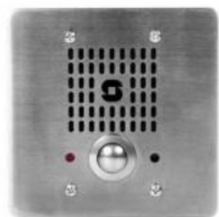
1008116020 TMIS-2 Turbine Mini Intercom