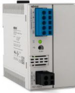
POWER SUPPLY 100-240V AC/48VDC 2A